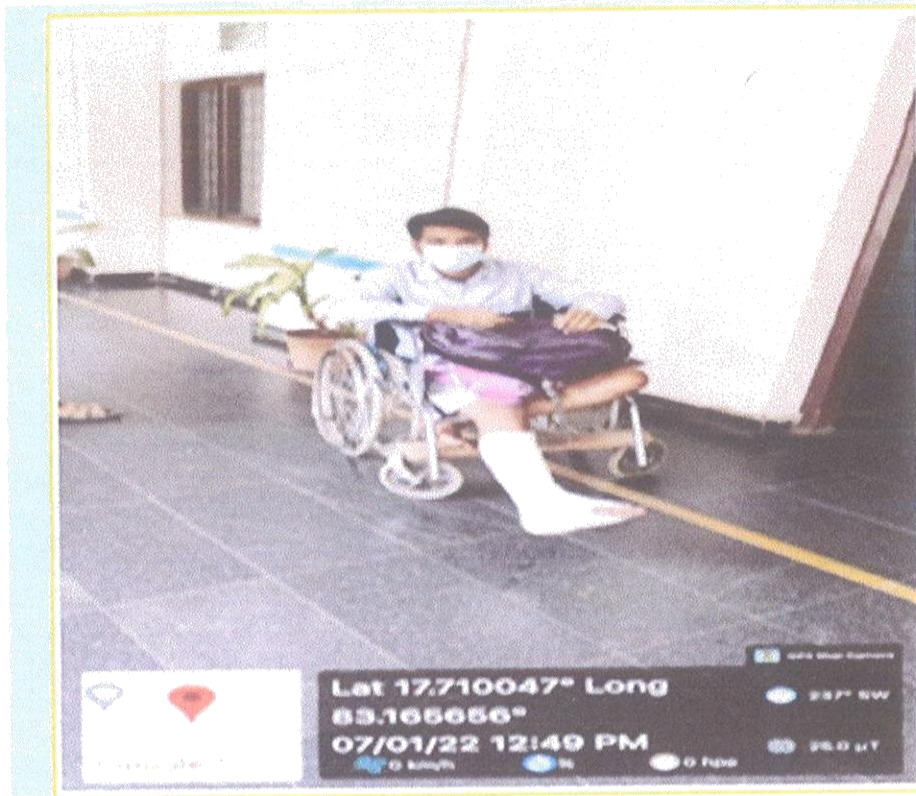
Provision of Wheel chair for Disabled Students