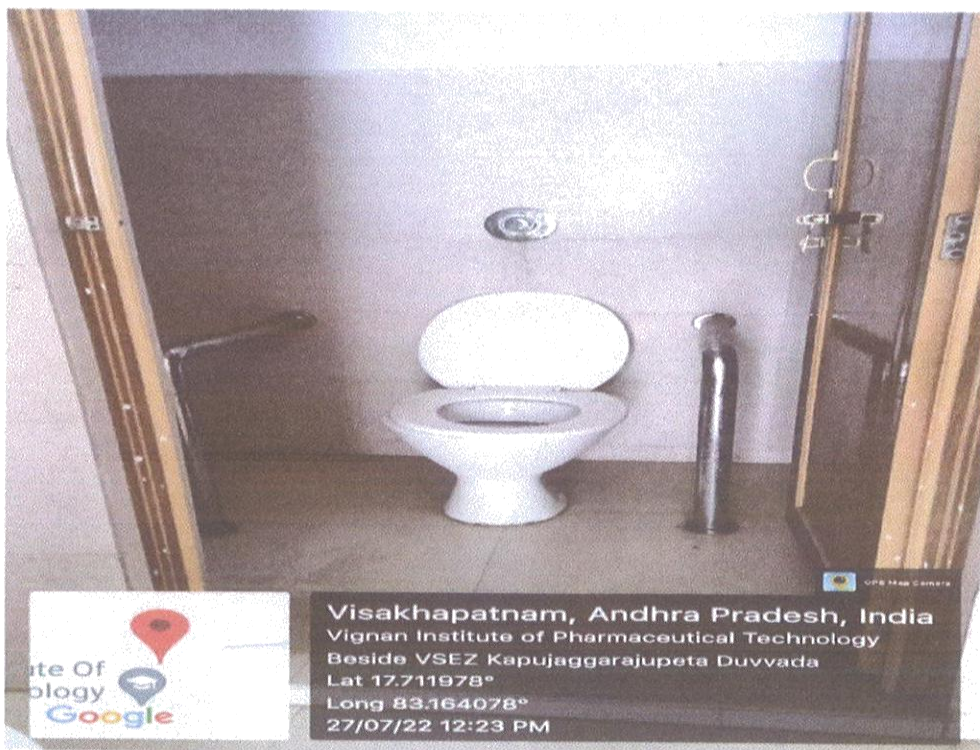
Disabled- Friendly Washrooms